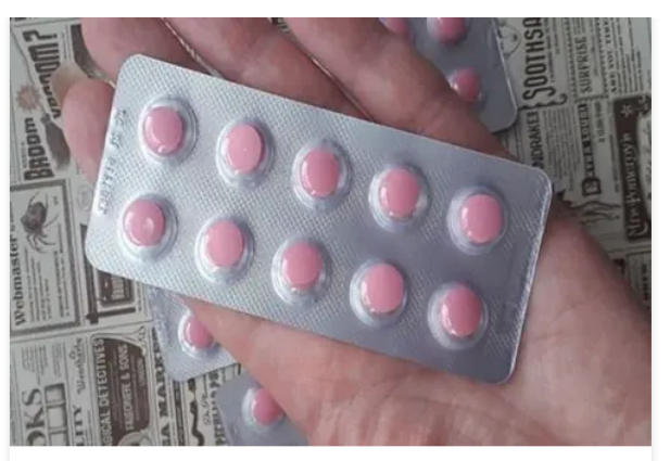
How To Normalize Blood Pressure? There Is A Homemade Trick