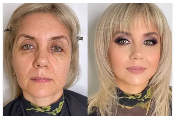
63-Year-Old Woman With Baby Face. Here's What She Does Before Bed More...