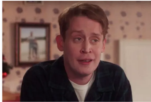
Culkin Cracks Up The Web With His Own Version Of 'Home Alone'