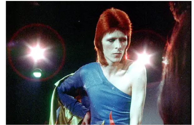
These Photos Make Us Nostalgic For The 70's