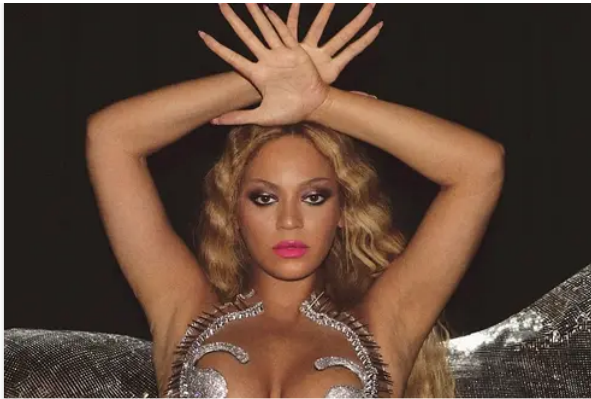
Top 10 Pop Divas (She's Not Number 1)