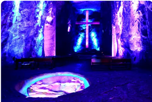
17 Astonishingly Beautiful Cave Churches