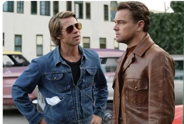
The Best Tarantino Movie Yet