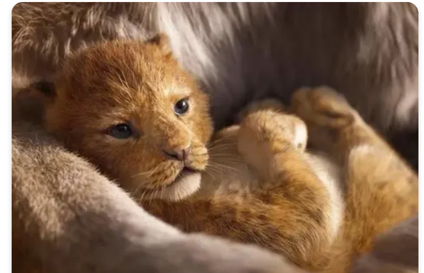
How They Made Little Simba Look So Lifelike in 'The Lion King'