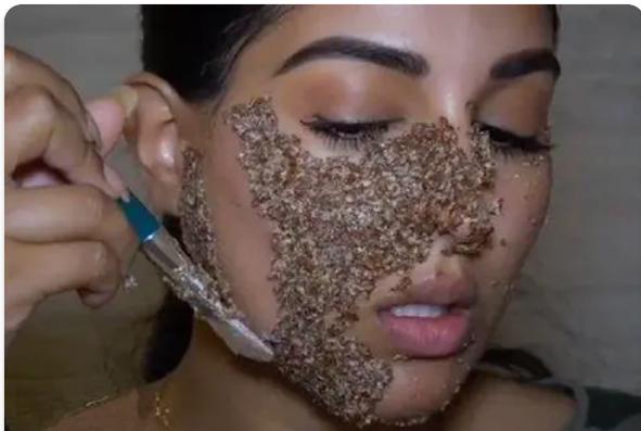
42-Year-Old Woman With Baby Face. Here's What She Does Before Bed