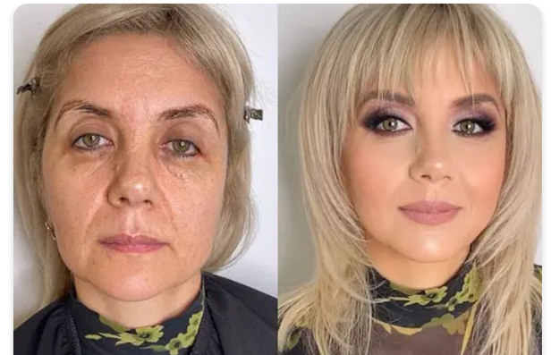
63-Year-Old Woman With Baby Face. Here's What She Does Before Bed