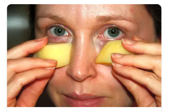
Doctors Hide The Truth! Easy Way To Get Rid Of Wrinkles At Home