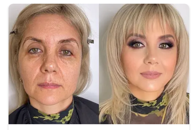
63-Year-Old Woman With Baby Face. Here's What She Does Before Bed