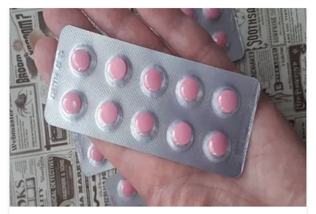
How To Normalize Blood Pressure? There Is A Homemade Trick